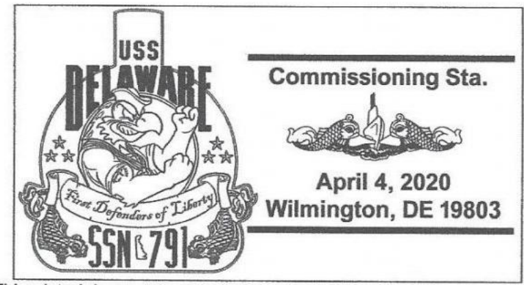
This pictorial was requested several months ago and was recently approved. It should make for some interesting "coronavirus covers".

The U.S. Navy today (4-4-20) commissioned USS Delaware (SSN 791) , the 18th Virginia-class attack nuclear submarine. Although the public commissioning ceremony at the Port of Wilmington was canceled due to restrictions of large public gatherings (COVID-19 virus), the ship made the transition to normal operations. Meanwhile, the Navy is looking at a future opportunity to commemorate the event with the ship's sponsor, crew and commissioning committee.