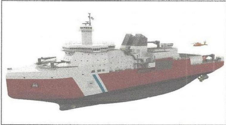
An artist's rendering of 's winning bid for the U.S. Coast Guard Polar Security Cutter.

Inc. has been awarded a $745M detailed design and construction contract for the Coast Guard's next-generation heavy icebreaker, according to a Tuesday Pentagon contract announcement. According to the announcement, the first-in-class ship will be built at the company's Pascagoula, Miss. shipyard and is scheduled to deliver in 2024. "The initial award is valued at $745.9 million and supports non-recurring engineering and detail design of the PSC class as well as procurement of long lead-time materials and construction of the first ship," read a statement from the Coast Guard and Naval Sea Systems Command. "The contract also includes options for the construction of two additional PSCs. If all options are exercised, the total contract value is $1.9 billion. The yet-to-be-named Polar Security Cutter will be the first of a planned class of six icebreakers – three heavy and three medium – the Coast Guard says it needs to meet the minimum requirements for the U.S. mission in the Arctic.