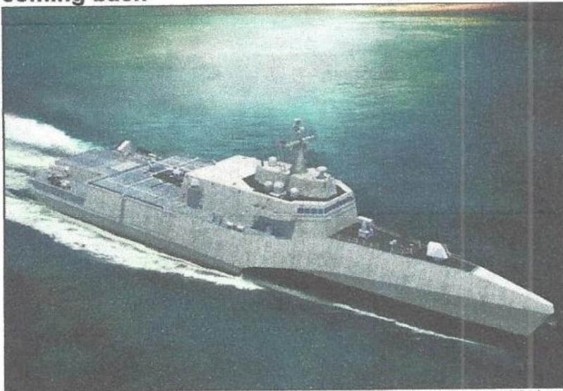
Artist's rendering of the Austal USA FFG(X) bid from SNA 2019.

The U S Navy, while embracing two variants of the LCS for many years, may be conceding that the LCS class of ships are under armed and under armored. To this end, contracts are about to be let to build ten new FFG class vessels. Our complete fleet of FFG's were decommissioned in the last decade. Some were