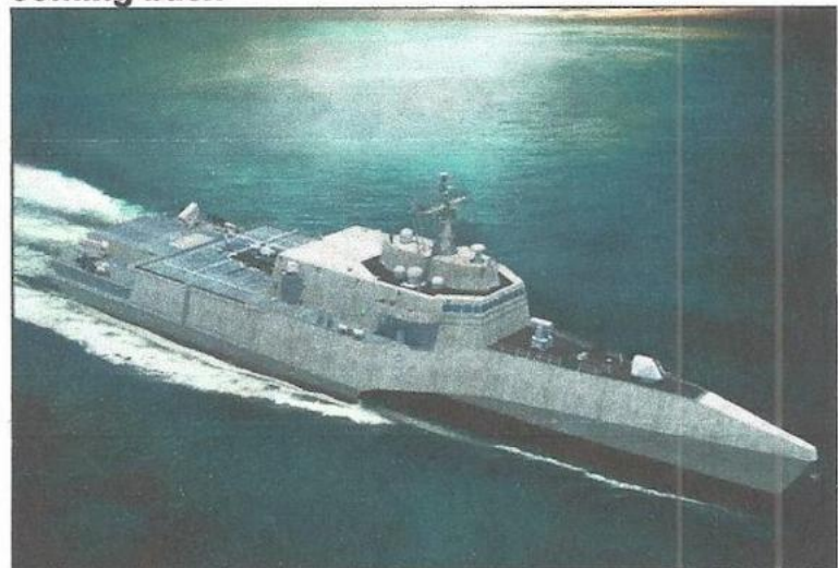
Artist's rendering of the Austal USA FFG(X) bid from SNA 2019.

The U S Navy, while embracing two variants of the LCS for many years, may be conceding that the LCS class of ships are under armed and under armored.