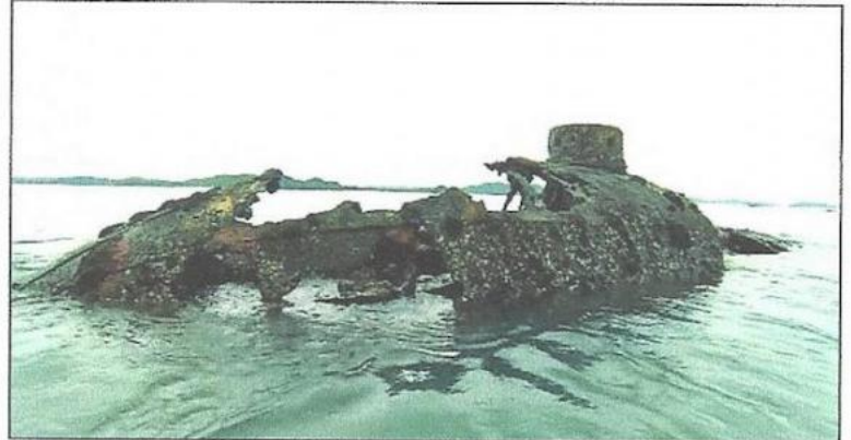
Deteriorating remains of submarine EXPLORER abandoned on a remote section of San Telmo Island, in Panama's Pearl Islands

his submarine from parts brought from New York to search for pearls off Panama's Pacific coast during the 19th century. Records say he died at age 47 of malaria, but some suspect he was killed by decompression sickness — also known as the bends. Kroehl was buried in 1867, and his grave was only rediscovered in 2005.