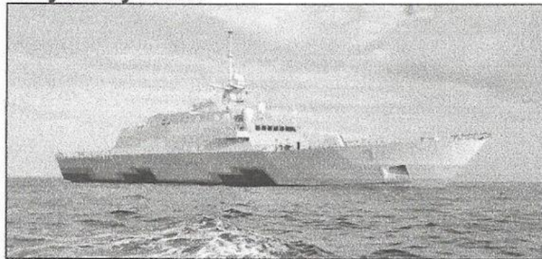
USS Fort Worth

It has been announced that Saudi Arabia wants to purchase four extremely up-gunned Freedom -class Littoral Combat Ships (LCS). The deal will be worth $11.25 billion including weapons and support. This will also be the first export sale for the troubled LCS program, and these Saudi ships will be far more capable than any version of the LCS the Navy plans on procuring. This fact may present an incredible opportunity for the Navy to get the version of the Littoral Combat Ship they really need, and possibly at an awesome price.