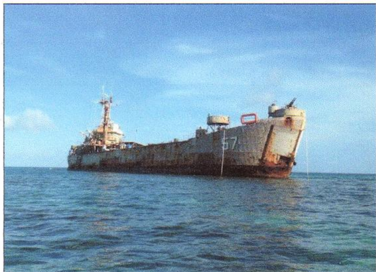
BRP Sierra Madre LT-57 manned by a contingent of Philippines Marines on Second Thomas Shoal in the Spratley islands

U S Naval Institute Daily Update July 21, 2015