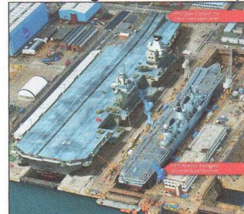
HMS Queen Elizabeth next to the current largest ship in the fleet HMS Illustrious.