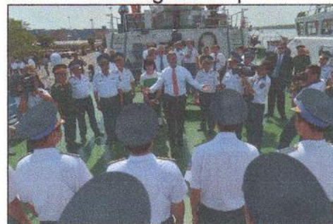
Carter aboard a Vietnamese Coast Guard vessel

(Reuters) May 31 U.S. Defense Secretary Ash Carter pledged $18 million on Sunday to help Vietnam buy U.S. patrol boats, shortly after touring a Vietnamese coast guard vessel that was hit by a Chinese ship during a skirmish in the South China Sea. Carter, who has been focusing on maritime security during an 11-day trip to the Asia-Pacific, visited the Vietnamese Navy headquarters and Coast Guard headquarters before boarding the ship.