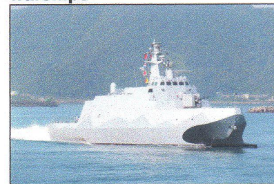
Catamaran ROCS Tuo Jiang PGG618

The Republic of China Navy has commissioned the first in a planned class of a dozen domestically constructed guided missile corvettes in a Tuesday ceremony.