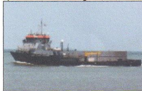
MV HOS Black Powder

Hornbeck Offshore Services of Covington LA announced the sale of three OSV's (Offshore Service Vessels) to the U S Navy. The sale was reportedly to comply with Congress. The three vessels currently mentioned are the MV HOS Arrowhead, the MV HOS Eagleview and MV HOS Westwind. A forth vessel will be sold later in the year, the MV HOS Black Powder. Hornbeck states the vessels are used by the Navy to support the submarine fleet. The vessels had previously been leased to the Navy. No mention of any name changes, but apparently the vessels are operated by the MSC for the Navy. HOS Arrowhead operates out of Port Angeles, WA.