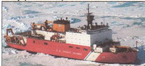
USCGC HEALY WAGB-20

Currently the Coast Guard has two operational icebreakers — heavy icebreaker USCGC Polar Star (WAGB-10) and medium icebreaker USCGC Healy (WAGB-20).