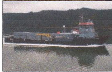
MV HOS Arrowhead

Hornbeck Offshore Services of Covington LA announced the sale of three OSV's (Offshore Service Vessels) to the U S Navy. The sale was reportedly to comply with Congress. The three vessels currently mentioned are the MV HOS Arrowhead, the MV HOS Eagleview and MV HOS Westwind. A forth vessel will be sold later in the year, the MV HOS Black Powder. Hornbeck states the vessels are used by the Navy to support the submarine fleet. The vessels had previously been leased to the Navy. No mention of any name changes, but apparently the vessels are operated by the MSC for the Navy. HOS Arrowhead operates out of Port Angeles, WA.