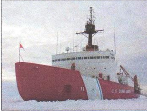
USCGC POLAR SEA

An independent study reveals the U S Coast Guard needs three heavy duty icebreakers and three medium duty icebreakers to fulfill their responsibilities in the Arctic and Antarctic regions in future years.