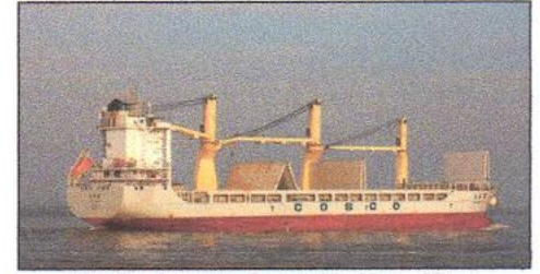
MV Da Dan Xia flagged in Hong Kong

On her last trip to the area the ship was found to have two Mig-21 jet fighters and other Soviet era weapons from Cuba buried under tons of sugar.