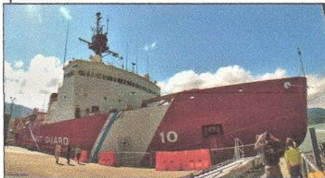
USCGC POLAR STAR WAGB-10

A study is underway to see if it is feasible to refurbish the currently decommissioned CGC POLAR SEA WAGB-11. If that is possible, it will give the icebreaker a ten year life extension. By next year the USCG will know if this is financially prudent. It will take some pressure off the USCG's responsibilities, but not the answer to getting where the USCG needs to be with icebreakers. One option would be a lease plan, which the USCG does not seem to favor. While the need has been established, how the USCG will get to that number or where the funding will come from is an open question.