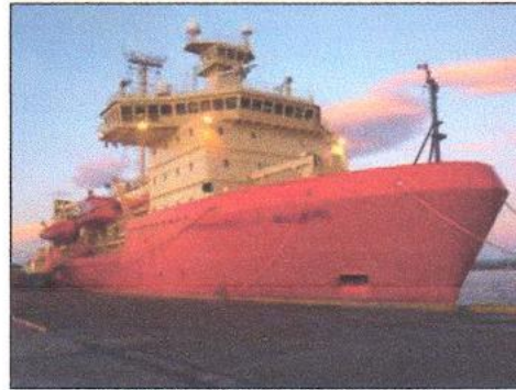
R/V NATHANIEL B. PALMER

Additionally the National Science Foundation (NSF) also leases a research icebreaker — R/V Nathaniel B. Palmer. She is an ice-capable research ship owned by Offshore Service Vessels LLC, operated by Edison Chouest Offshore.