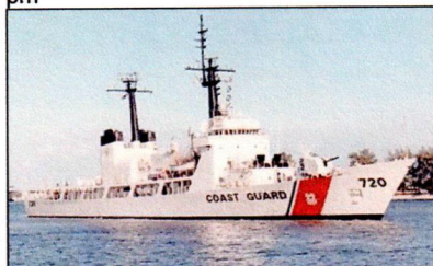
USCGC SHERMAN WHEC-720

Posted: Friday, January 16, 2015 12:25 pm