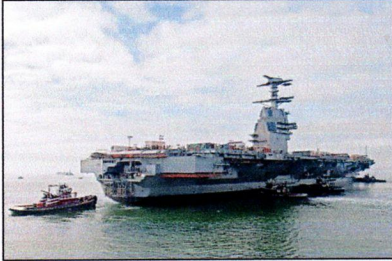
Gerald R. Ford (CVN 78) launch at the Newport News shipyard, November 17, 2013.