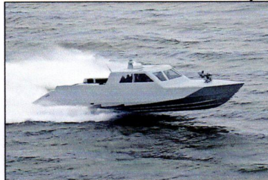
Combatant Craft Medium Mark 1

One year from now, the United States Special Operations Command (USSOCOM) will commission its first Combatant Craft Medium Mark 1 (or CCM Mk1): A new generation of special warfare craft that is set to replace the ageing fleet of Special Operation Command's Mark V boats as well as RHIBs for select missions. Navy Recognition contacted the USSOCOM to learn more about the CCM Mk1, the US Special Forces craft of the 21st century.