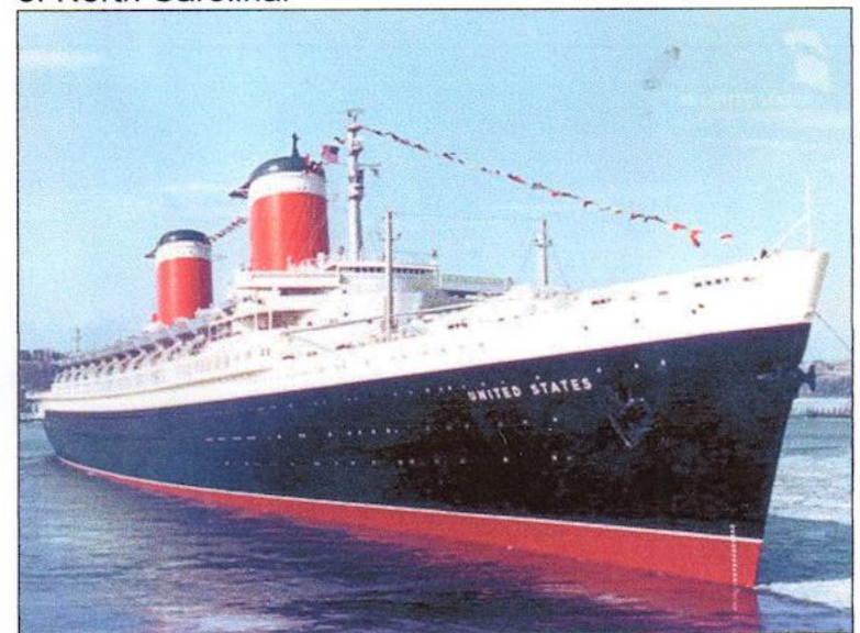
Photo in her early days

Drivers along Philadelphia's waterfront and I-95 have been treated to an unsightly view of one of this country's greatest ocean liners. In and out of bankruptcy and seized once by the U S Marshals office, the SS United States Conservancy (current owners) is about to lose the ship as it can only pay the $60,000 monthly fee another month. She has been stripped of asbestos, including much of her valuable interior that used to be aboard. One of her luxurious bars is in a restaurant on the Outer Banks of North Carolina.