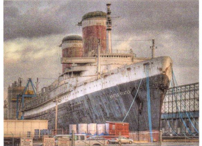
In Philadelphia, Photo credit SS United States Conservancy

Drivers along Philadelphia's waterfront and I-95 have been treated to an unsightly view of one of this country's greatest ocean liners. In and out of bankruptcy and seized once by the U S Marshals office, the SS United States Conservancy (current owners) is about to lose the ship as it can only pay the $60,000 monthly fee another month. She has been stripped of asbestos, including much of her valuable interior that used to be aboard. One of her luxurious bars is in a restaurant on the Outer Banks of North Carolina.