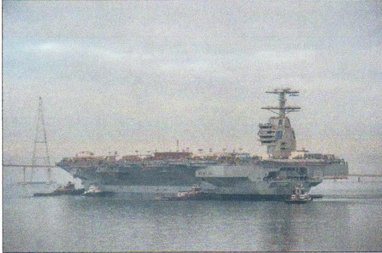
The future USS Gerald R. Ford (CVN-78) supercarrier during launch at Newport News Shipbuilding in November 2013.

The sea trial schedule for the aircraft carrier USS Gerald R. Ford has been delayed six to eight weeks after shipboard tests fell behind schedule, the U.S. Navy said on Tuesday. The aircraft carrier, being built by Huntington Ingalls Industries Inc, is scheduled to be delivered to the Navy on March 31, 2016. "The exact impact on ship delivery will be determined based on the results of sea trials," the Navy said in a statement. It said the work on the carrier, which is being built at a shipyard in Newport News, Virginia, was 93 percent complete.