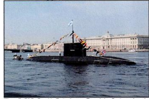
The B-585 Sankt Peterburg , Russia's first and only completed Lada-class submarine.

Russia to give China more advanced submarine technology