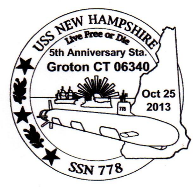
Additional pictorials planned are shown above.