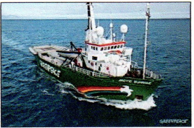
Dutch flagged Arctic Sunrise

Greenpeace also said its vessel was boarded in international waters and called on Russian President Vladimir Putin to release the crew The ship is now immediately. expected to be taken to the Russian port of Murmansk. The Russian foreign ministry earlier accused the of "aggressive group provocative" behaviour. It said the actions of the activists who had tried to board Gazprom's Prirazlomnaya Wednesday drilling rig on "threatened people's lives and could lead to environmental catastrophe in Arctic with unpredictable consequences". Moscow also said that its coastguard vessel had to fire warning shots across the Dutchflagged Arctic Sunrise.