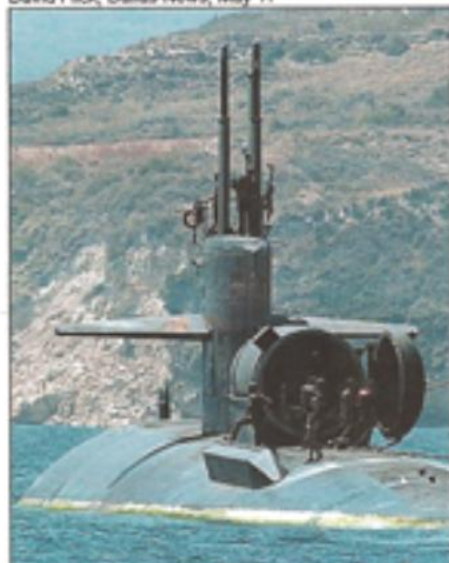
USS Dallas SSN-700