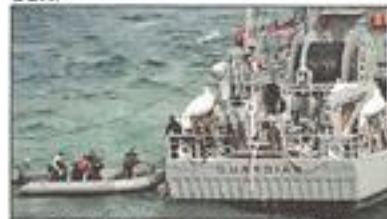
Sem photo early in grounding.