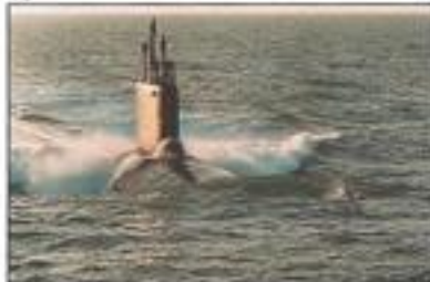
Minnesota during sea trials, note two dolphins frolicking with the sub.