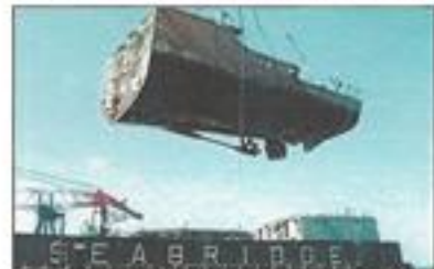
Final section lifted off onto barge.

Final lift of the last section of the ex- USS Guardian was on 30 March 2013 by MV Jascron 25 and placed aboard Barge SEABRIDGE . The ship was officially decommissioned and struck from the Navy register (NVR) on 15 February 2013.