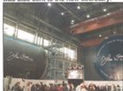
Photo of Keel Authentication by Huntingdon Industries

Back in February a request went in to our contact at the Newport News VA post office for a pictorial for the Keel Laying of the USS JOHN WARNER SSN-785 on March 16, 2013. A week later I had an email from the contact (the Postmasters secretary) that she was retiring in a few days. I was able to get the name of her replacement and just to be sure on the request, it was also sent to the new secretary.