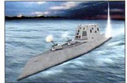
Note "tumblehome" construction in artist's rendition

Her deckhouse was built by Huntington Ingalls Industries in Gulfport, Mississippi and barged to Bath Iron Works in Bath Maine.