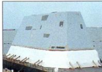
Deckhouse on a barge enroute Bath Maine

Her deckhouse was built by Huntington Ingalls Industries in Gulfport, Mississippi and barged to Bath Iron Works in Bath Maine.