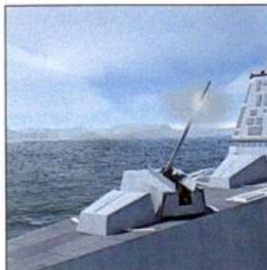
Artist conception of the BAE AGS for DDG-1000 class destroyers