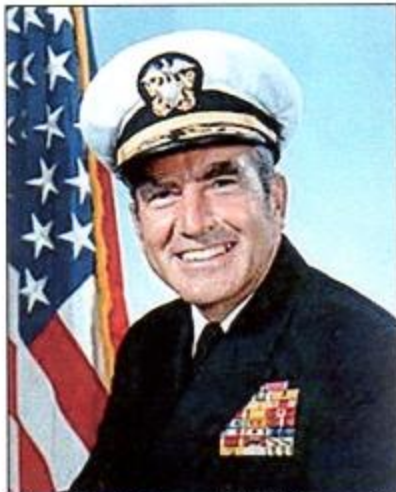
Adm. Elmo R. Zumwalt, USN famous for his "Z Grams"

While the ship was under construction for months, PEO laid the keel of the ZUMWALT on 17 November 2011.