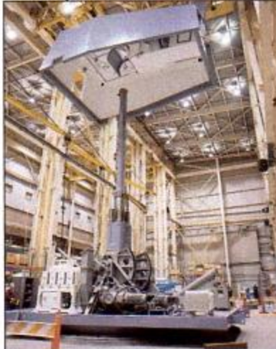
BAE4762 Advanced Gun System for DDG 1000

Bath Maine but no date has been set yet. Not only is the ship "different" but construction methods are decidedly unique. Several different contractors are "building" major sections of the new ship; her gun is being developed and built by BAE systems in Fridley, MN. Recent news says BAE is relocating to Kentucky.