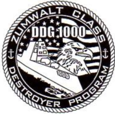
PEO logo/crest for the Zumwalt class project.

Building a new breed of ship – USS ZUMWALT DDG-1000