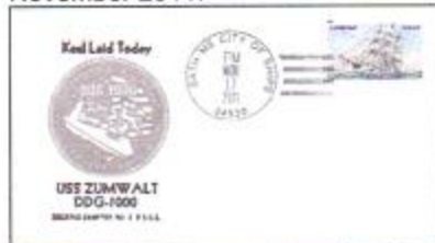
Decatur Chapter cover for the Keel Laying of USS Zumwalt ($2.50)

While the ship was under construction for months, PEO laid the keel of the ZUMWALT on 17 November 2011.