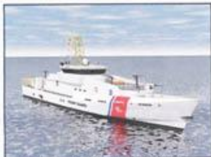
Artists rendition of Sentinel-class patrol craft

All Fast Response Cutters delivered as part of the Sentinel-class will be named after enlisted Coast Guard heroes.