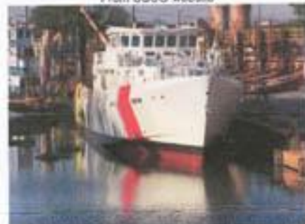
Launch of USCGC William Flores

Additional information about these Coast Guard heroes can be found at http://coastguard.dodlive.mil/2010/10/coast-guard-heroes/ .