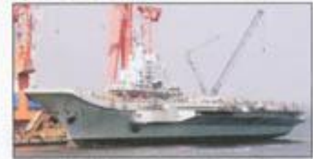
ex-USSR Varyag in Chinese yard being rebuilt

I have received perhaps a half dozen forwards from different quarters, mostly non-collectors with reference to the "new" Chinese aircraft carrier. The forward has flashy artist renditions of the "new" carrier.