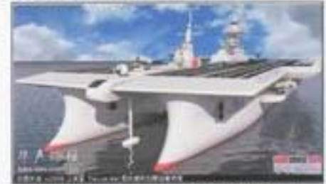
Above and other photos circulated as "new" PLAN carrier

I have received perhaps a half dozen forwards from different quarters, mostly non-collectors with reference to the "new" Chinese aircraft carrier. The forward has flashy artist renditions of the "new" carrier.