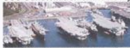
Independence, Constellation, Ranger and USS John C. Stennis (partially visible) at PSNS 2006

No Bremerton WA pictorial for USS Constellation anniversary