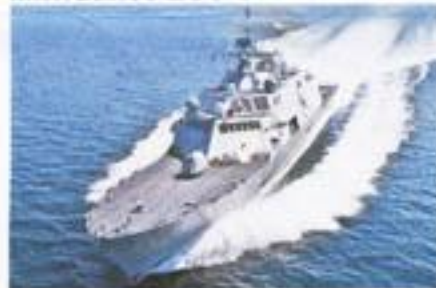
From Program Executive Office Littoral Combat Ship Public Affairs

Keel Laid for Future USS Milwaukee LCS-5