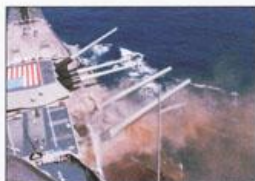
USS Iowa BB-61, explosion in turret # 2 on 19 April 1969. This accident will probably remain as one of the key incidents aboard the USS Iowa during her illustrious career.