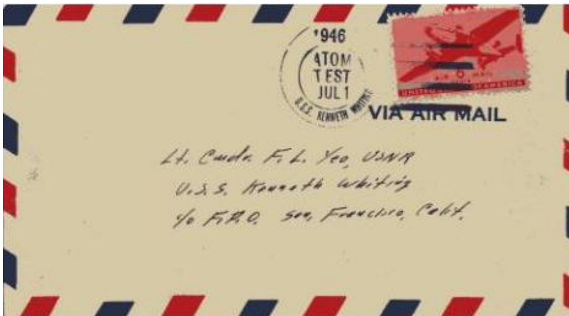
USS KENNETH WHITING (AV-14), 1 July 1946 slogan postmark.

According to my research on Operation CROSSROADS, it would be possible to obtain postmarks from 70 out of 167 support ships and 38 out of 95 target vessels during the time period 6 February to 26 September 1946, that were in the waters of northern Marshall Islands. This figure includes the reported continual use of cancellation devices after the ships last day of postal service. One source stated that covers were sent to 140 ships with returns from 120 ships.