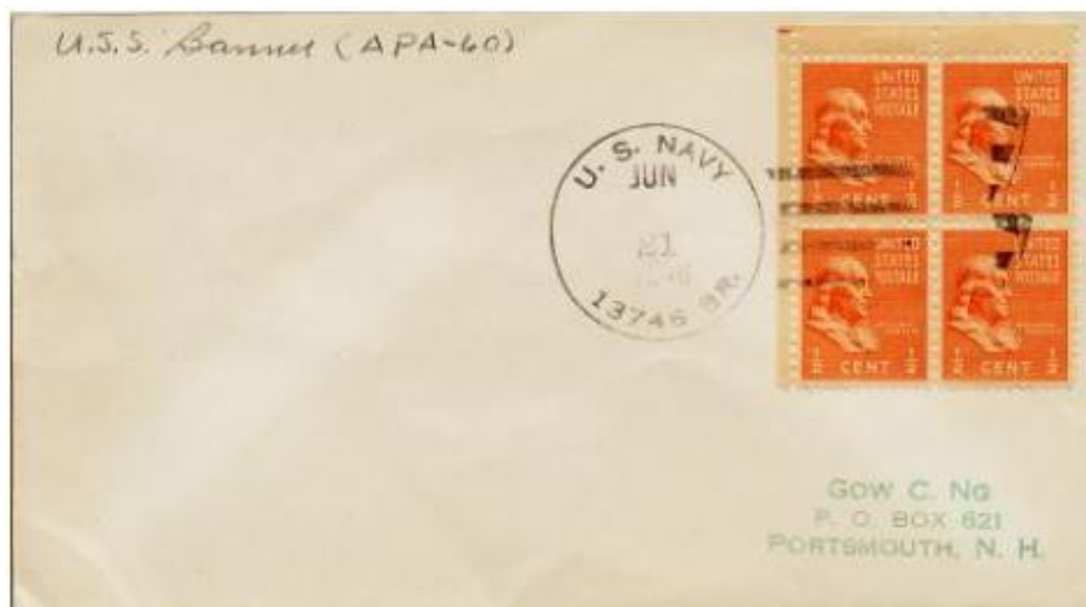
LST-861, FPO 13746.

Three post offices were available during Operation CROSSROADS, besides the ships that had their own operating post offices. The JTF-1 used a Type 2 # Fleet Post Office (FPO), Navy Brach Number 13746, which was active from 1 October 1945 to 2 September 1946. This mobile post office was located aboard support ship LST-861.