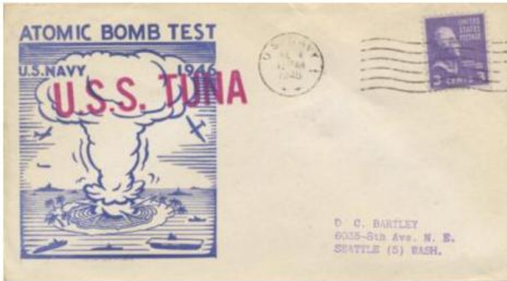
LST-861, T-7qz(2) machine cancel.

Army Post Office (APO) 22212 SF was also used by JTF-1 according to its needs in support of the nuclear tests at Operation CROSSROADS and was used with later nuclear tests in the Marshall Islands. Additionally, Navy Number USN - SF 3078 was also assigned to Bikini Atoll.