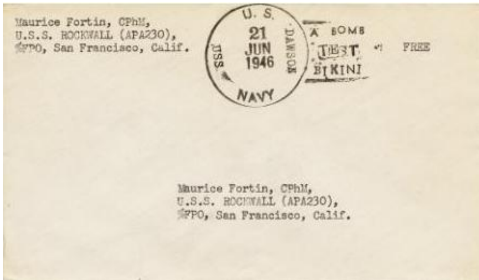
USS DAWSON (APA-79), Type P (D-6) slogan cancel.

Army Post Office (APO) 22212 SF was also used by JTF-1 according to its needs in support of the nuclear tests at Operation CROSSROADS and was used with later nuclear tests in the Marshall Islands. Additionally, Navy Number USN - SF 3078 was also assigned to Bikini Atoll.